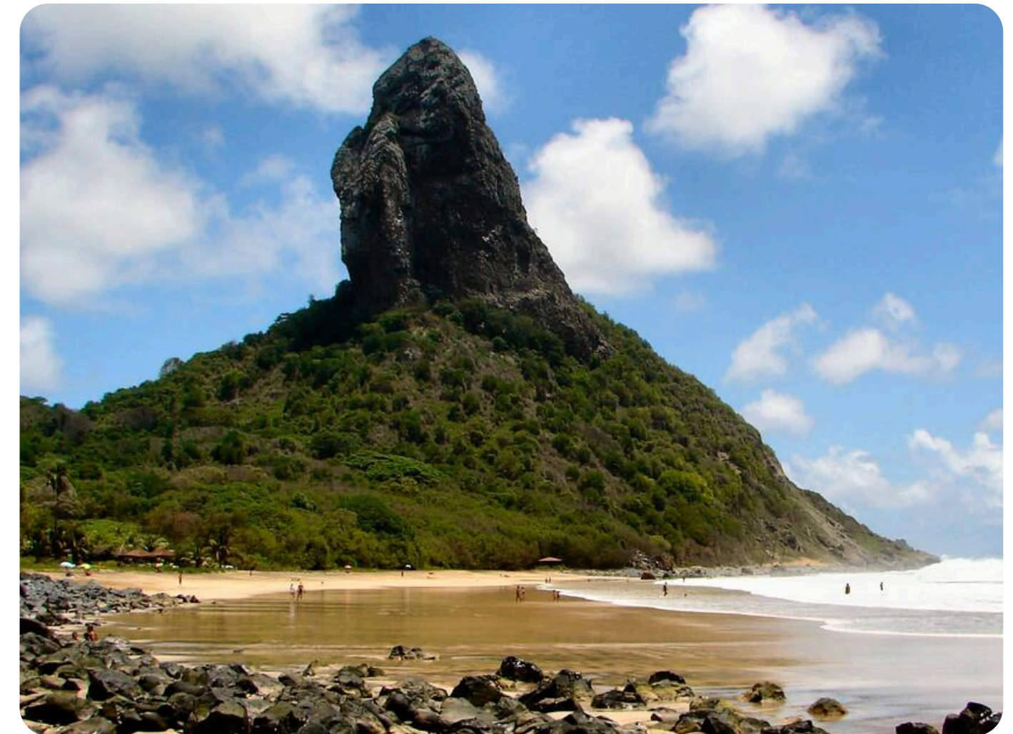
Image: volcanic peak and coastline, Brazilian Atlantic Islands – Fernando de Noronha and Atol das Rocas Reserves