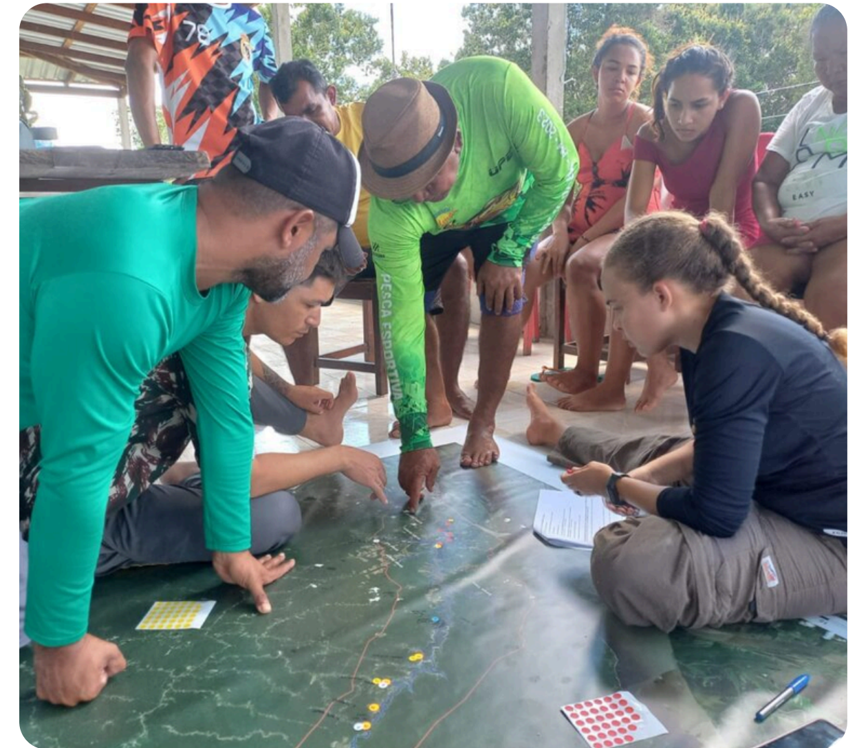
Image: Participatory mapping of the Lower Rio Preto Fishing Agreement with residents of Praia Nova community.